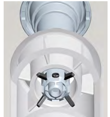
For a Stable Holding